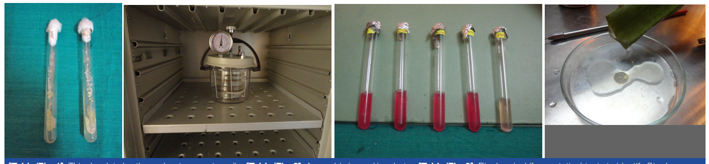
[Table/Fig-1]: Thioglycolate broth used as transport media. [Table/Fig-2]: Anaerobic jar and incubator. [Table/Fig-3]: Biochemical (fermentation) tests to identify Staph aureus. [Table/Fig-4]: Collection of mucilaginous gel of aloe vera.

[Table/Fig-8]: Determining degree of freedom between and within groups of ora pathogens using ANOVA. * p<0.001; Highly significant for microbes