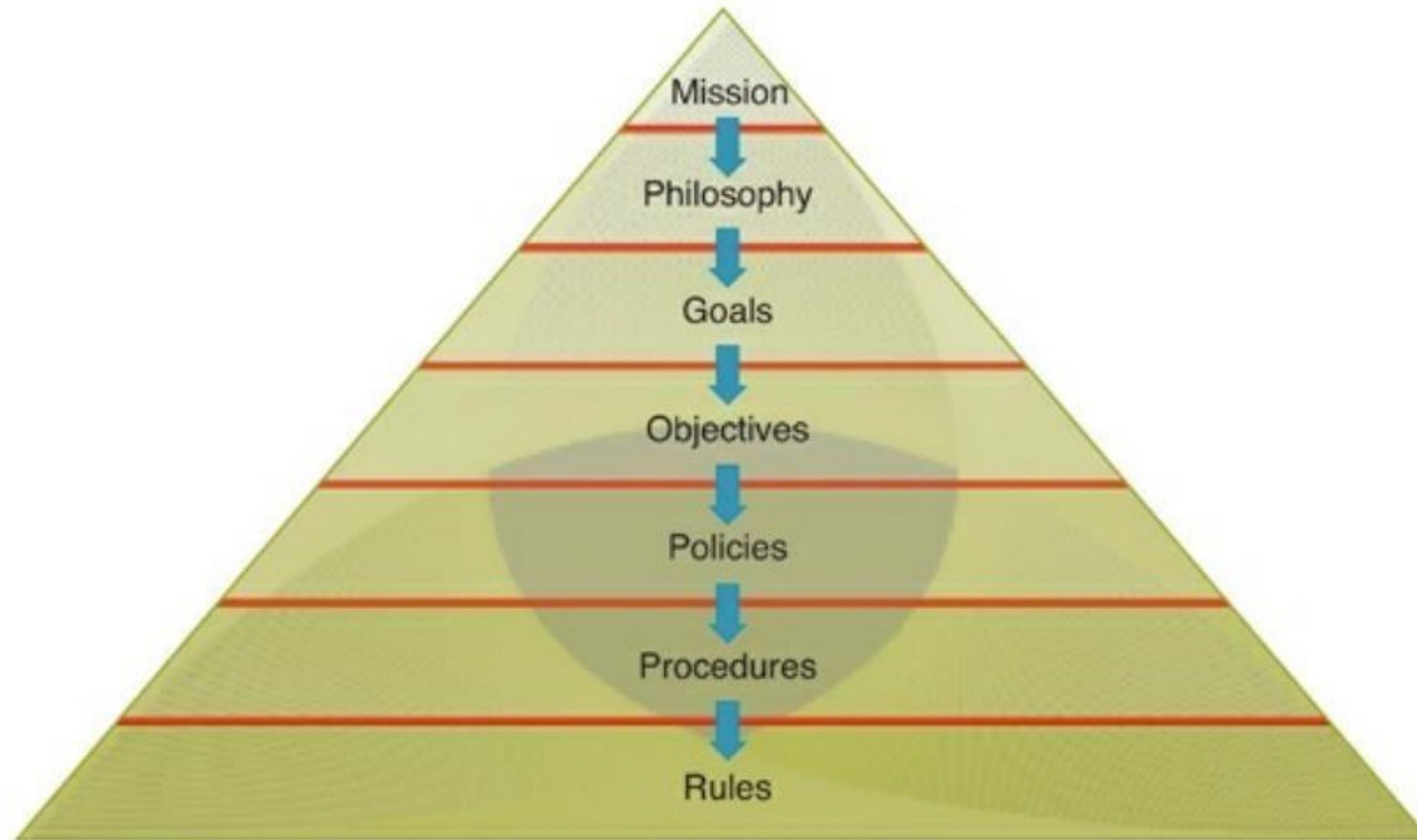
FIGURE 7.1 The planning hierarchy.